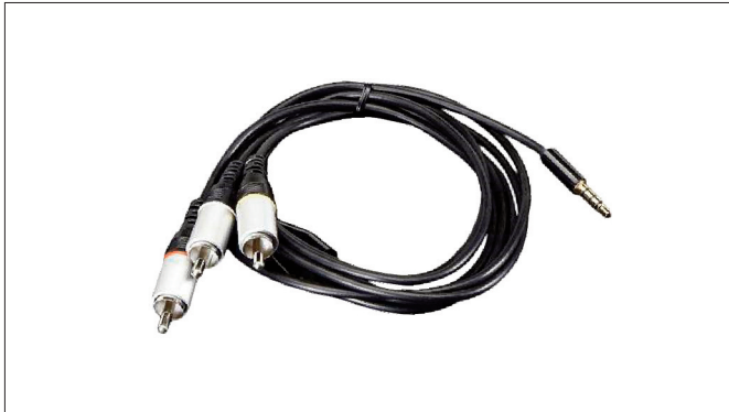
A/V external video cable - P/N: 978853000