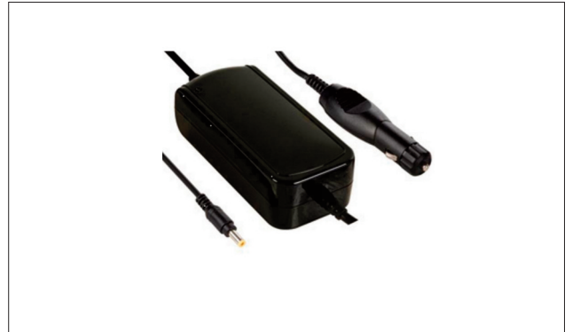
Car cigar lighter adapter: - P/N: 978361000