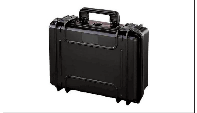
Carrying case - P/N: 978852000