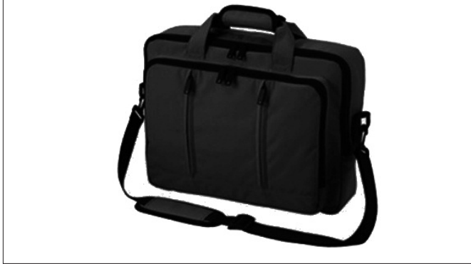
Carrying bag (provided in standard) - P/N: 978851000