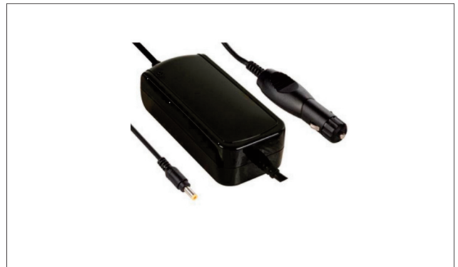
Car cigar lighter adapter: - P/N: 978361000