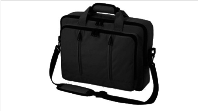
Carrying bag (provided in standard) - P/N: 978851000