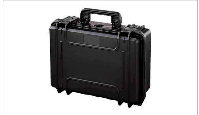
Carrying case - P/N: 978852000