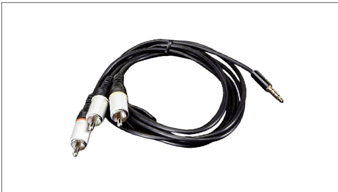
A/V external video cable - P/N: 978853000