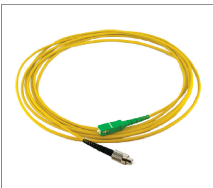
Optical fiber patchcord FC-APC / SC-APC - P/N: 978754710