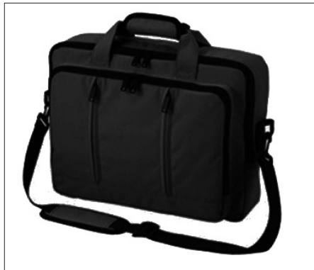
Carrying bag (provided in standard) P/N: 978851000