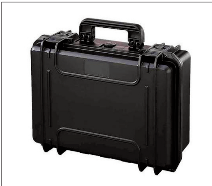
Carrying case - P/N: 978852000