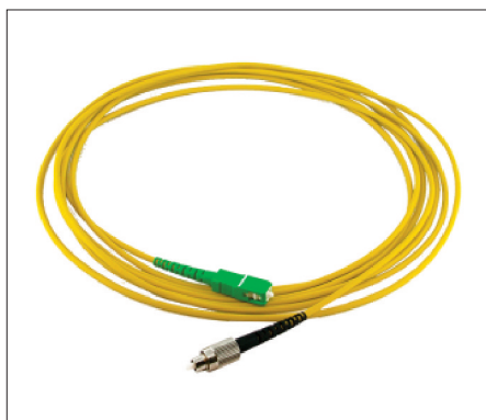
Optical fiber patchcord FC-PC / PC-APC - P/N: 978754700