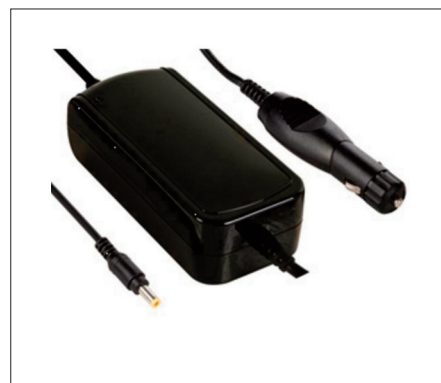
Car cigar lighter adapter P/N: 978361000