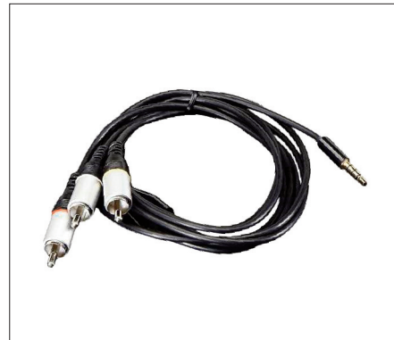
A/V external video cable P/N: 978853000